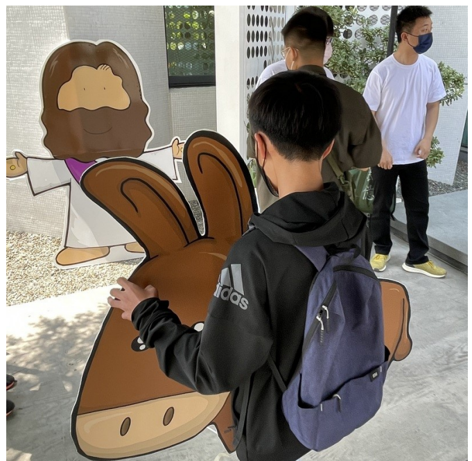
A youth taking a donkey to Jesus

One day I was buying a drink at the 7-11 near the church. The manager asked me what I was doing in Water Forest Village. Few outsiders visit this place. I told her that I was speaking at the Presbyterian Church. She replied, “We all love that church.” I asked her if she was a Christian. She said, “No, but the church loves the children of our community, so we love the church.” A non-Christian store manager becomes a witness for the church.