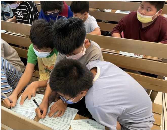
Children at the church responding to questions about the Scripture of the day.