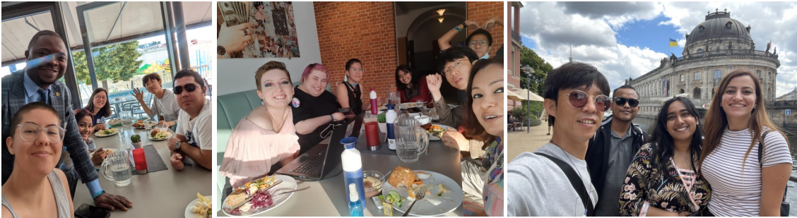
Meeting friends from different countries