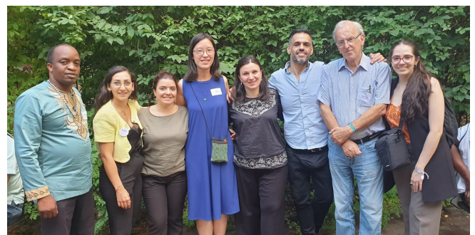
Current Global Staff team: (L to R) Regional Executive for Africa, Middle East, Latin America and the Caribbean, Asia-Pacific and Europe, General Secretary, Finance Officer and Communication officer. Picture taken at Berlin GA.